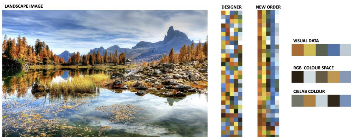
Figure 2: Example data representation for Image 3 in the experiment. The raw colour palettes obtained visually are labelled as DESIGNER and the visual data shows the average colour palette (VISUAL DATA) produced by the participants. The VISUAL DATA colour palette is compared with the colour palettes produced by cluster analysis using RGB and CIELAB colour spaces.